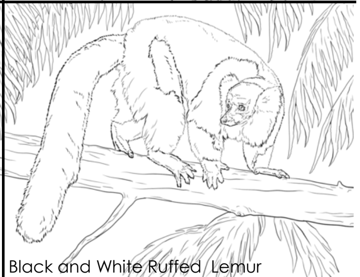
Black and White Ruffed Lemur