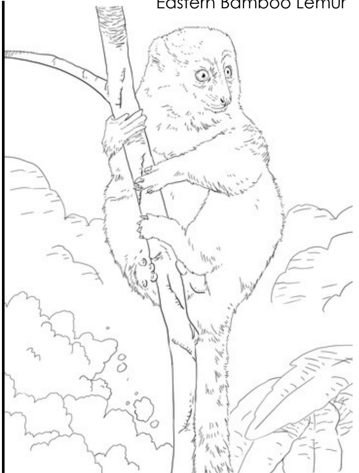
Eastern Bamboo Lemur